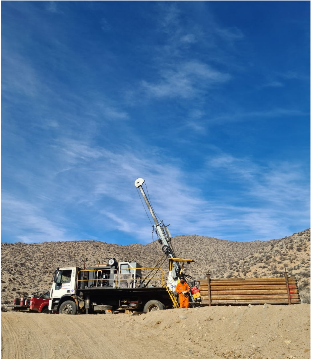
Figure 2: Drilling commences on hole SLDD005 at San Lorenzo, Chile.